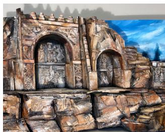
"Taq-e Bostan, Arch of the Garden"